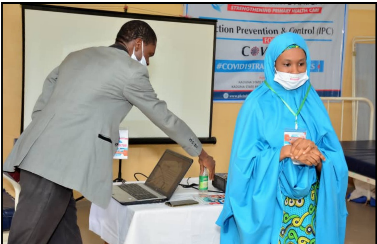
Participant Demonstrating Hand Hygiene After The Training.

1. #COVID19TrainTheTrainers- This is a capacity building programme pegged at training the hospital frontline workers on Infection Prevention and Control (IPC) for COVID-19 in the primary health care centres. We train 10 to 15 personnel per facility on IPC with emphasis on COVID-19. These personnel consist of doctors, nurses, pharmacists, medical laboratory scientists, ward attendants, volunteers etc. After the rigorous each participant is certified at no either to the hospital or the participants. It's 100% free with light refreshments for all the participants. The goal is to ensure that the frontline workers are better informed on how to protect themselves, their patients, the visitors and the community as a whole. So far the programme is ongoing in Kaduna State, Nigeria and we hope to replicate what we do in Kaduna to atleast four other states in Nigeria before the end of 2020.