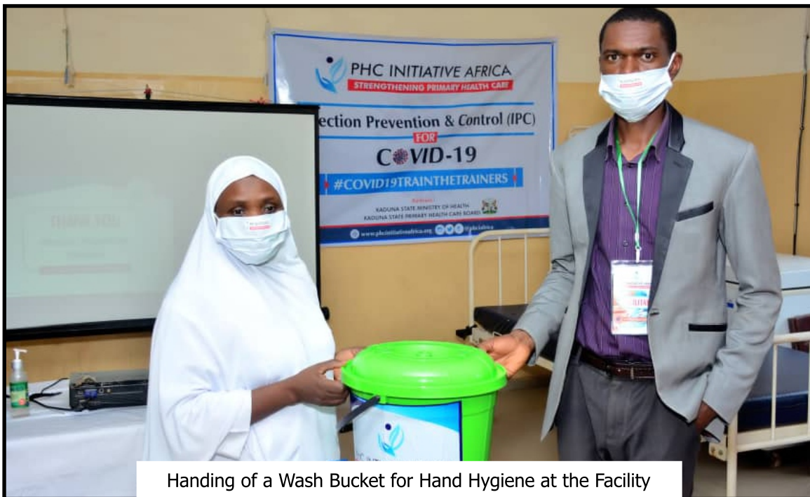
Handing of a Wash Bucket for Hand Hygiene at the Facility

2. #NursePerSchool - COVID-19 has affected every sphere of human endeavor directly or indirectly. Hence schools were closed. Nurse Per School campaign is one of our most darling projects meant to improve the health of the students directly and by extension their homes. This is a campaign geared towards ensuring that governments through proper legislations mandate schools (pre-primary, primary and high schools) to have at least a health personnel as a full time staff in the school that will nurse the health and well being of the students or pupils through health education in schools and monitoring.