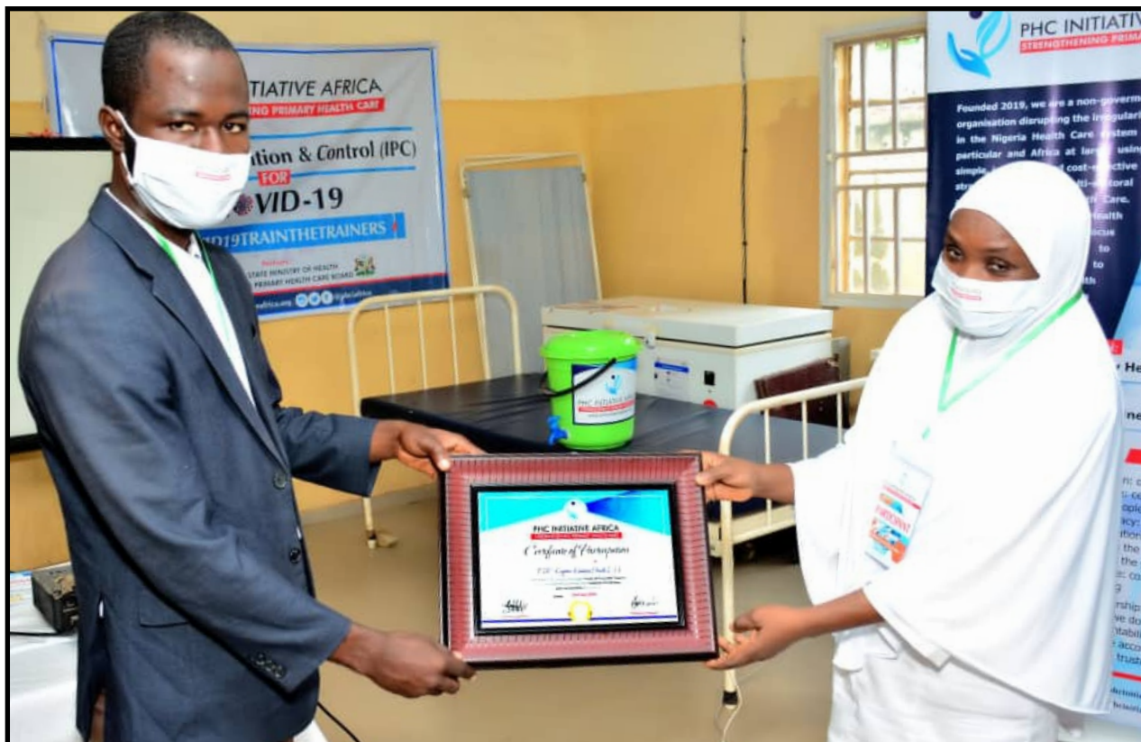
Presentation of PHC Initiative Africa IPC Certificate for COVID-19 Training to the Nurse in-charge of the Facility