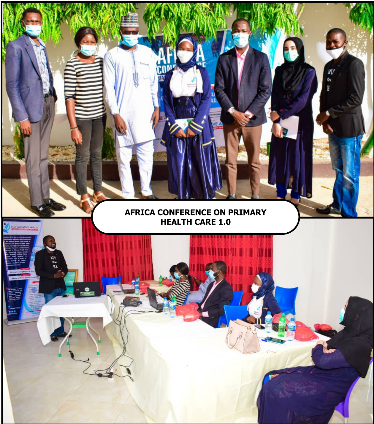
AFRICA CONFERENCE ON PRIMARY HEALTH CARE 1.0