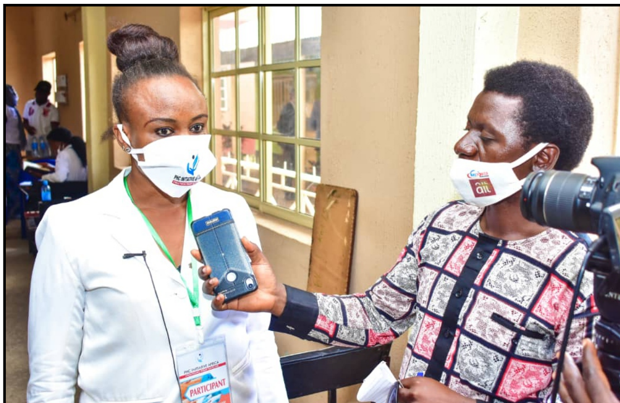
A Nurse Participant interviewed on the importance of IPC Training on Themselves, the Patients and the Visitors.